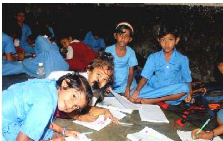
Right to Education (RTE)- We learn

The Union government passed the Right of Children to Free and Compulsory Education Act, 2009 is a step in the right direction. For the first time in India's history, children will be guaranteed their right to quality elementary education by the State with the help of families and communities. All children between the ages of six and 14 shall have the right to free and compulsory elementary education at a neighbourhood school. The RTE act is the first legislation in the world