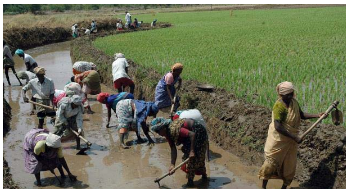
Food for thought

The Mahatma Gandhi National Rural Employment Guarantee Act aims at enhancing the livelihood security of people in rural areas by guaranteeing hundred days of wage-employment in a financial year to a rural household whose adult members volunteer to do unskilled manual work.