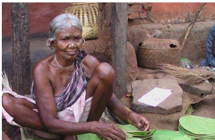
My source of sustenance

The Forest Rights Act has been implemented by ama adhikar from the year 2008. ama adhikar is directly involved in villages of Kalahandi and Nuapada districts. The program covers 97 villages distributed over 9 GPs of 5 Blocks of two districts. All these villages have completed the village level processes and submitted their final claims to SDLC. More specifically the following activities were performed during the years.