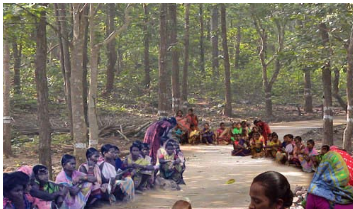
Community is Strength

ama adhikar organizes Gram Sabha frequently as per the necessary of the Gram Panchayat in the presence of the government official and village people in the coverage district. Ensure at least 80 percent of active participation among the villager in the process of decision making, planning and implementation of various developmental schemes. It should be followed by proper documentation and resolution signed by the villagers and govt.