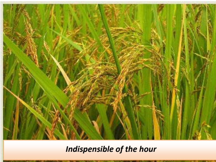
Indispensible of the hour

On the midnight of August 14th – 15th 1947, Pandit Jawaharlal Nehru referred to a new dawn in our history and our entering into a Tryst with Destiny. Being aware that widespread poverty in the country has its roots in agricultural stagnation, Nehru remarked, “everything else can wait, but not agriculture”. This led to several policy and programme initiatives such as; enlarging the area under assured irrigation, producing the inputs needed by farmers such as