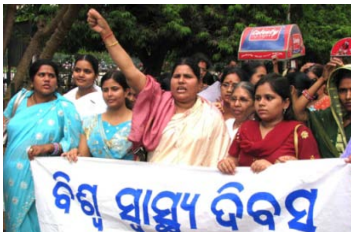
Health awareness through community participation

Community, our program is highly effective at gaining their attention and changing their attitudes. We run School Health Sessions where we give students basic health knowledge to share with their families. The students are becoming